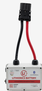
CAT # NDV9