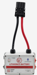
CAT # NDV9