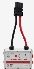
CAT # NDV9